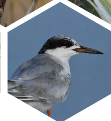
Clockwise from top: Purple Gallinule ; Barred Owl ; Painted Bunting ; Common Tern ; Bald Eagle ; Sedge Wren